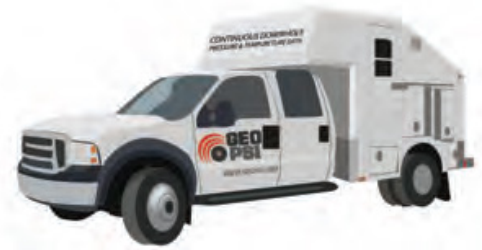
Continuous Data Acquisition. 4 x 4 All Terrain Truck.